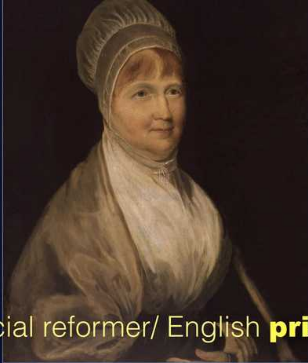
Elizabeth Fry (1780 - 1845)

(social reformer/ English prison reformer )