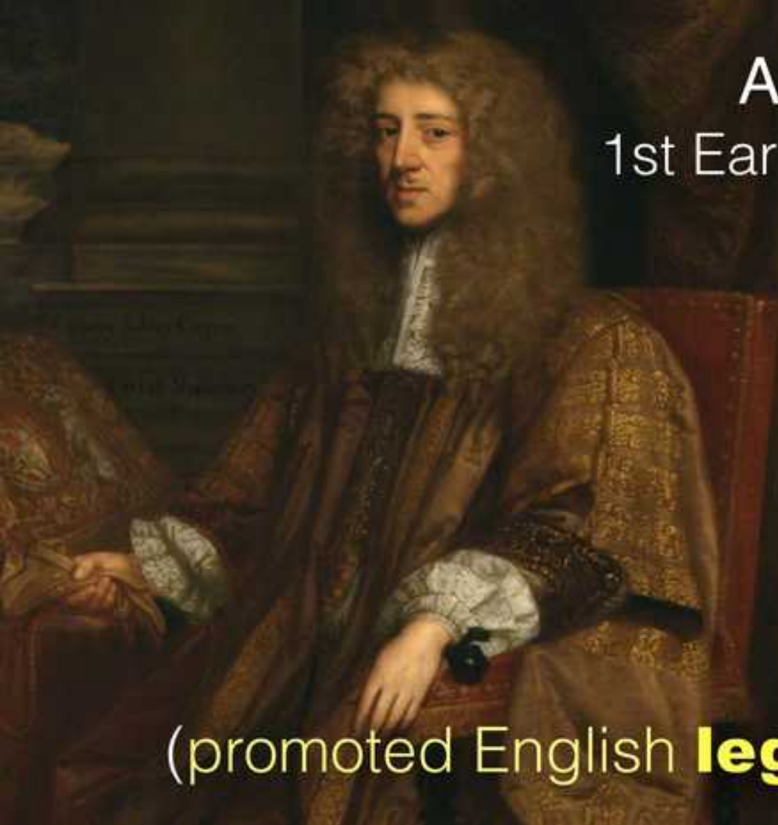
Anthony Ashley Cooper 1st Earl of Shaftesbury, England (1621 - 1683)