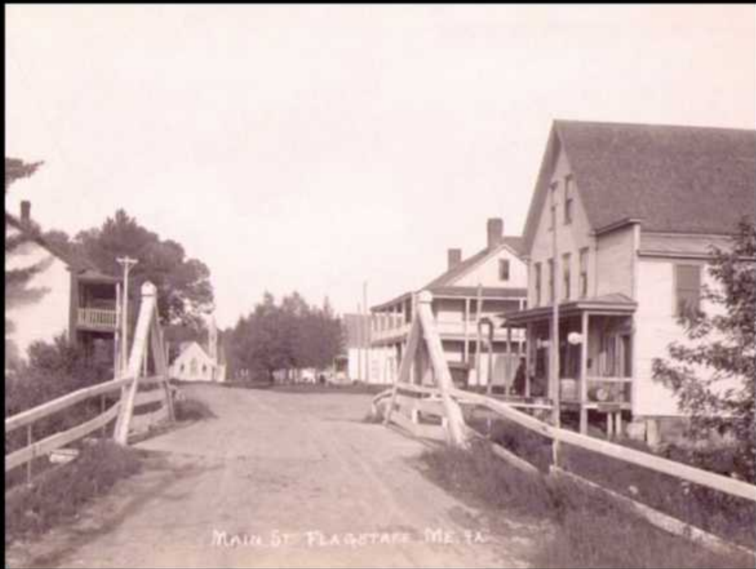
MAIN ST. FLAGSTAFF ME. 9A